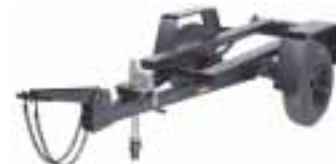
K956-1 Large Welder Trailer