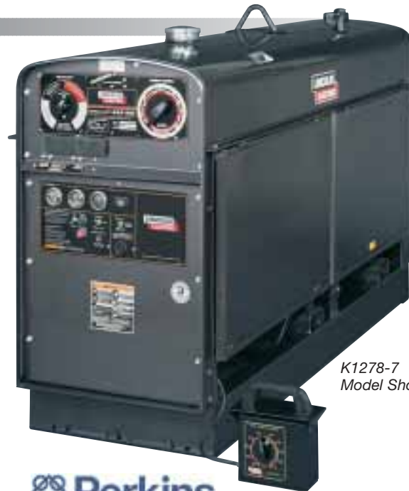
K1278-7 Model Shown