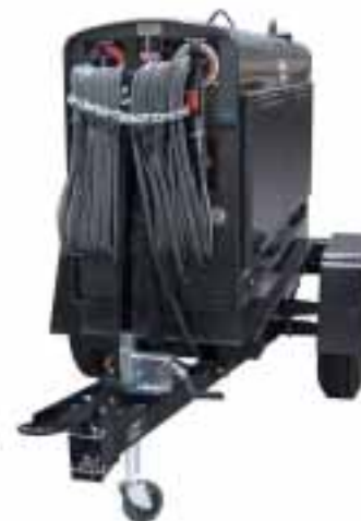
Completely Assembled Ready-Pak