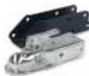
K958-1 2" Ball Hitch