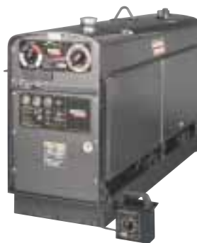
K1278-7 Shield Arc® SAE-400